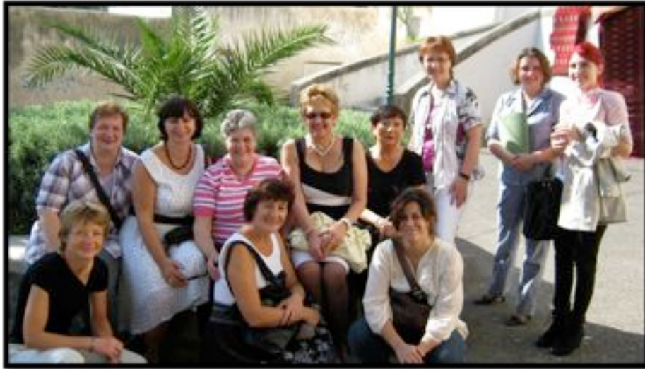
Enjoying the sun in Ischia