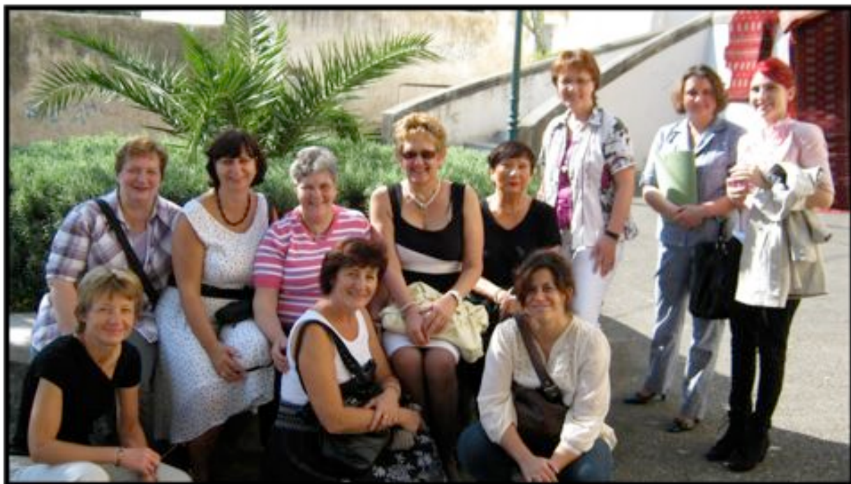
The group who visited the Serrara Fontana nursing home